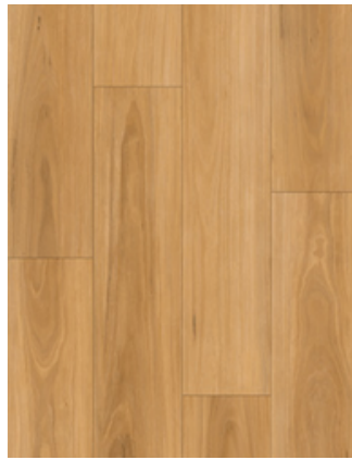
New England Blackbutt