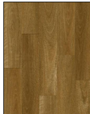
Native Spotted Gum