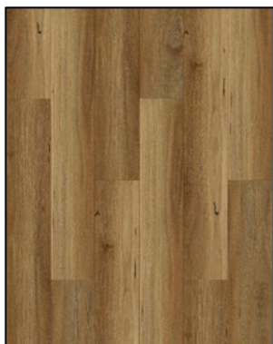
NSW Spotted Gum