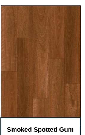
Nsw Spotted Gum